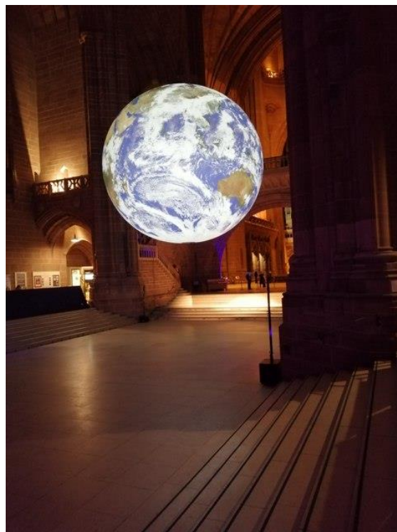
THE AREA OF THE CATHEDRAL WHERE WE MET THE DUCHESS OF GLOUCESTER, UNDERNEATH THE HUGE 23FT REPLICA OF THE EARTH WHICH WAS CREATED FROM DETAILED NASA IMAGERY.