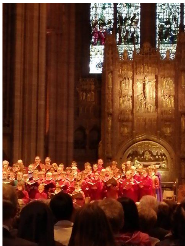
PART OF THE CHOIR DURING THE CONCERT