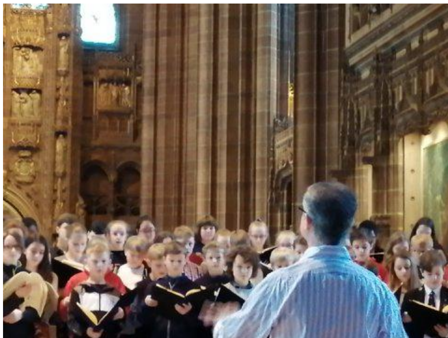
PICTURE FROM OUR REHEARSAL